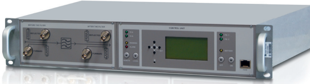
> SCS 300/350