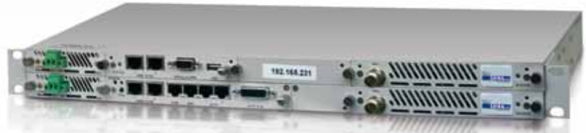
> SDIDU - DRS - In configuration 1 + 1