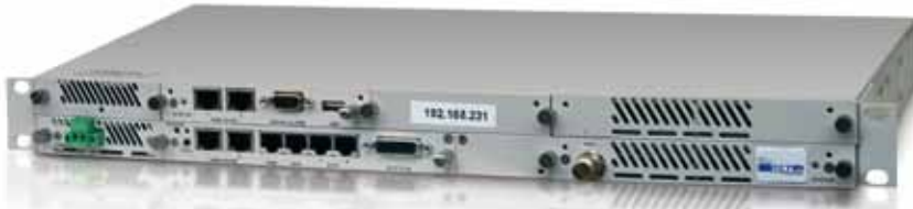
> SDIDU - DRS - In configuration 1 + 0