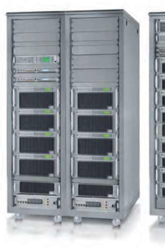
> SDT 203 ARK-6 With Dual Driver Option