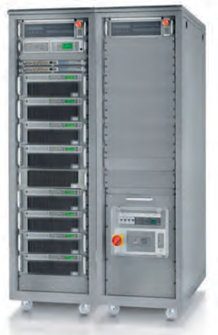
> SDT 203 W ARK-DAB Liquid Cooled Version with Dual Driver Option