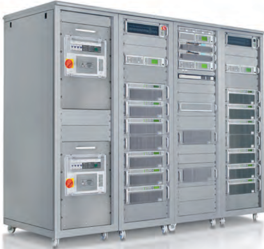
> SDT 303 ARK-6 With Liquid Cooling and Dual Driver Option