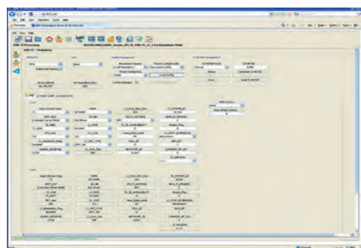
GUI, main page.