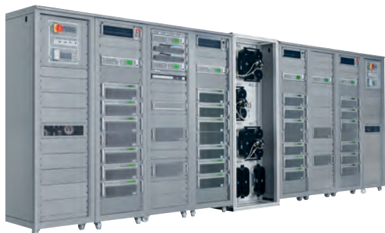
> SDT 603 ARK-6 With Dual Driver Option and Liquid Cooling