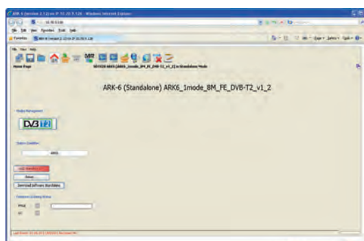
GUI, modulation page.

Specifications and characteristics are subject to change without notice.