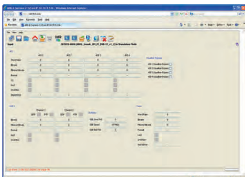
GUI, input page.